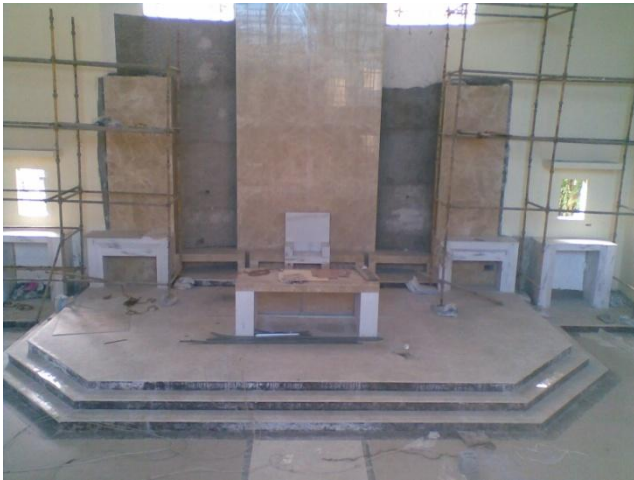
The main altar work in progress

3 stain glass designs depicting events in St.Peter's life