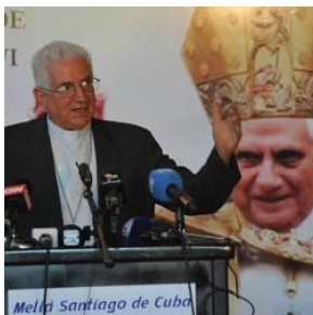
Dionisio Garcia, archbishop of Santiago de Cuba

People are “proud” that Benedict XVI is coming to their island, and see him as bringing hope and helping push forward the transformation of their country