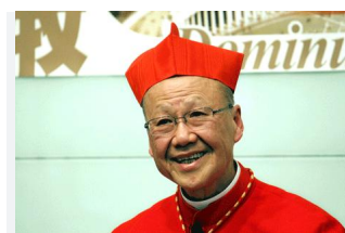
Cardinal John Tong of Hong Kong