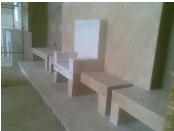
The celebrants' seating in marble stones