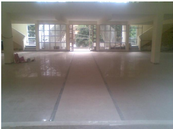
The new Church view from the sanctuary