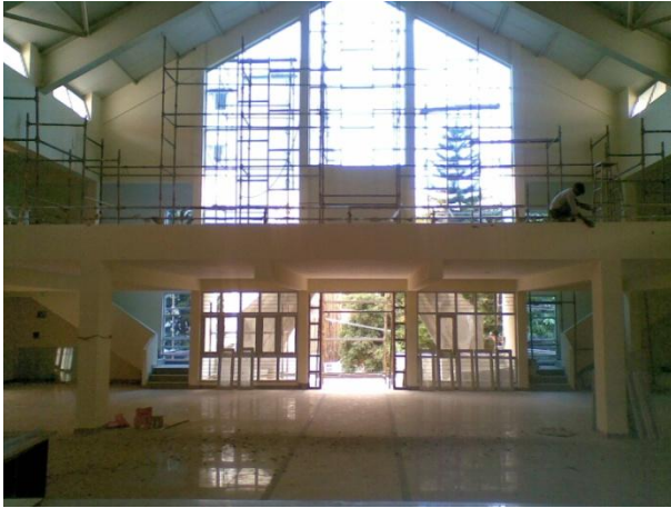
New church view with balcony & high roof